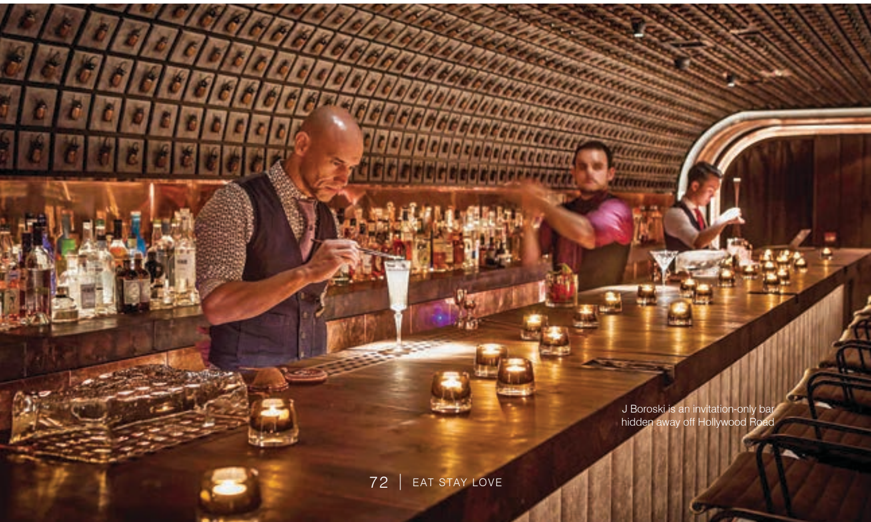
J Boroski is an invitation-only bar hidden away off Hollywood Road

All Things Nice, India's leading wine, spirit and luxury consulting and marketing agency. He currently lives in Mumbai