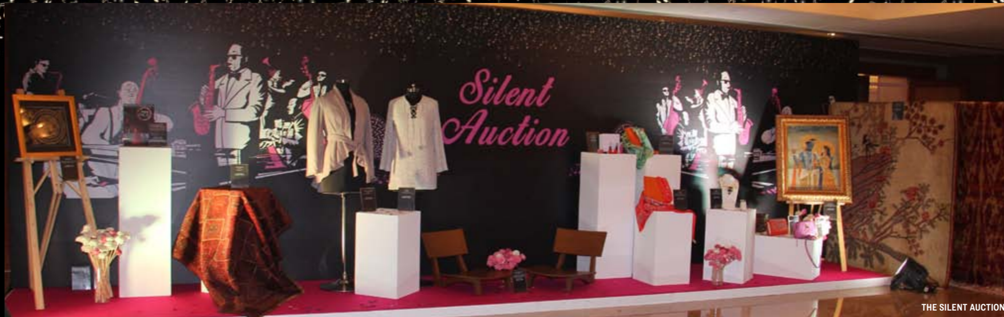
THE SILENT AUCTION