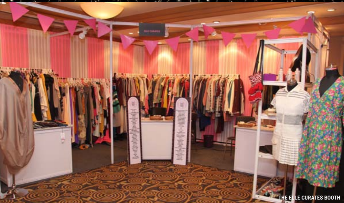
THE ELLE CURATES BOOTH