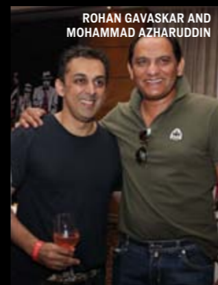
ROHAN GAVASKAR AND MOHAMMAD AZHARUDDIN